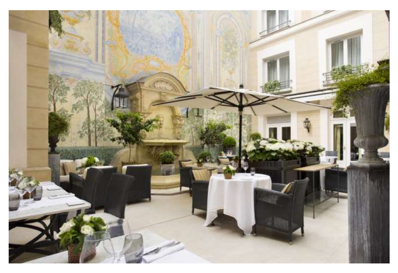
L'Assaggio Bar & Salon de Thé

L'Assaggio restaurant is open every day from Tuesday to Saturday for lunch and dinner, from 12:00 pm to 2:30 pm and from 7:30 pm to 10:30 pm. Closed on Sunday and Monday. August closed.